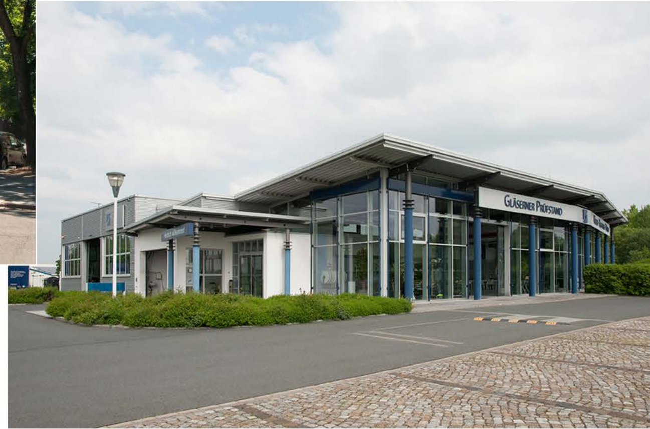
FSD – Central Agency for PTI in Germany